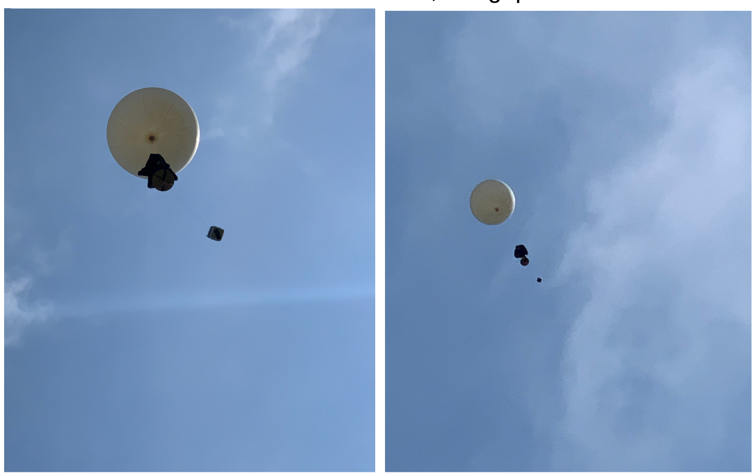
Copyright © 2022 Housatonic ARC, All Rights Reserved