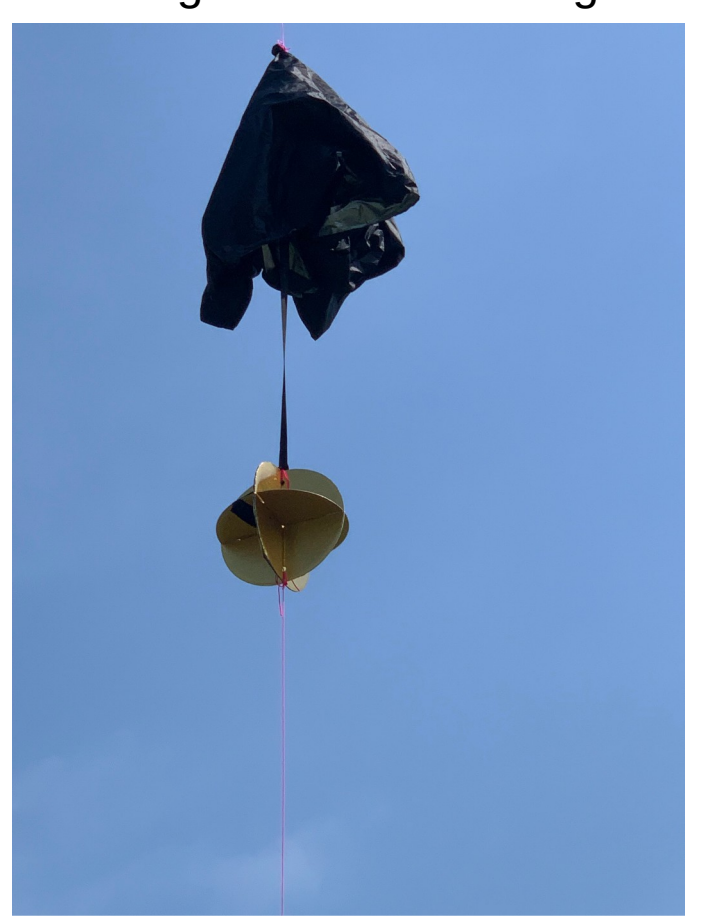
Flight of AB1JC-11 Light APRS Tracker May 21, 2022