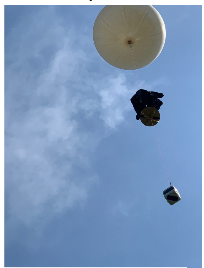
Launch from Veteran's Park, Bridgeport CT