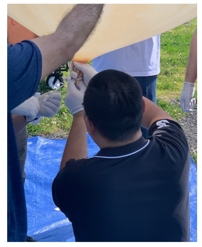
Copyright © 2022 Housatonic ARC, All Rights Reserved