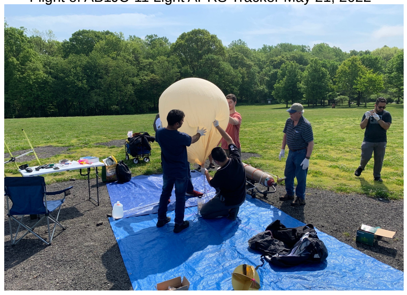
Filling the 800 gr balloon with helium